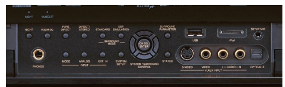
Inside of the trapdoor